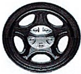
STANDARD PIU WHEEL