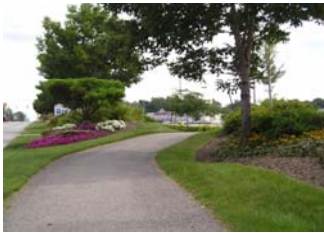
Hawthorne Valley Bike Path Richmond Road

While in Washington DC I enrolled our community in the National League of Cities (NLC) Prescription Discount Card Program. The CVS Caremark administers the NLC prescription discount card program. More than 59,000 retail pharmacies and all major pharmacy chains nationwide participate in the program. With this program our residents without prescription coverage can save an average of 20% off the retail price of prescription medications. You will be notified as soon as we receive the NLC prescription discount cards which can be distributed by your council member, picked up at village hall and many of our local pharmacy chains. We expect to receive the cards in six to eight weeks